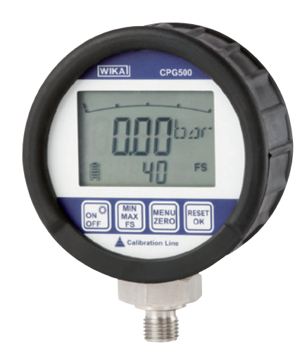
Digital pressure gauge model CPG500